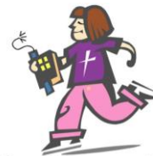
School Prayer Walk

Lebanon County School Prayer Walks will be held on Saturday, May 4, 2024. The Cornwall UMC Praying Hands group will gather at Cornwall Elementary School at 9:30 A.M. to walk and pray for the teachers, students and staff. Everyone is invited to join us! In case of inclement weather, we will meet at the church.